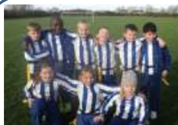
Tag Rugby B Team