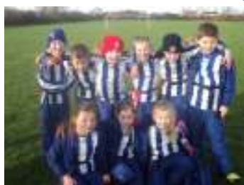
Tag Rugby A Team

Well done to both teams who have shown brilliant team work!