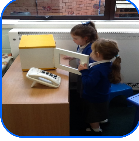
"Amazing things happen here"