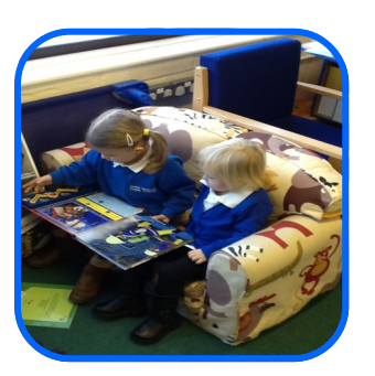
Learn in a safe, caring and welcoming environment