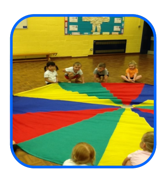
Enjoy exciting and stimulating learning opportunities