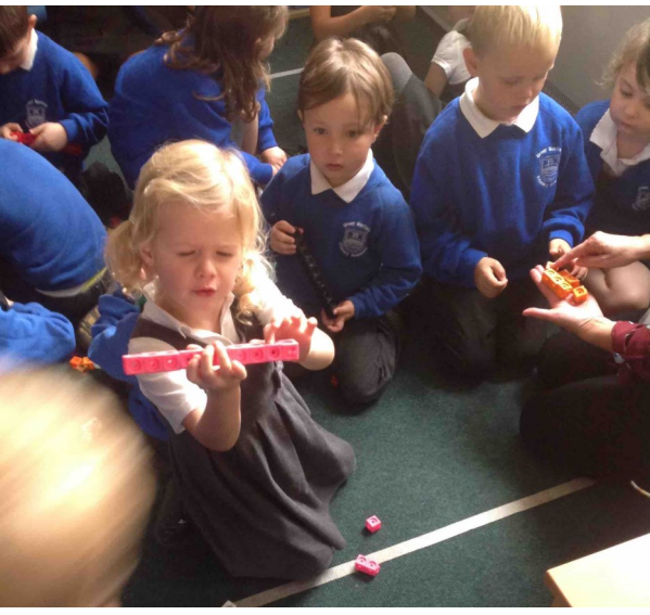
Using multilink to make number 10