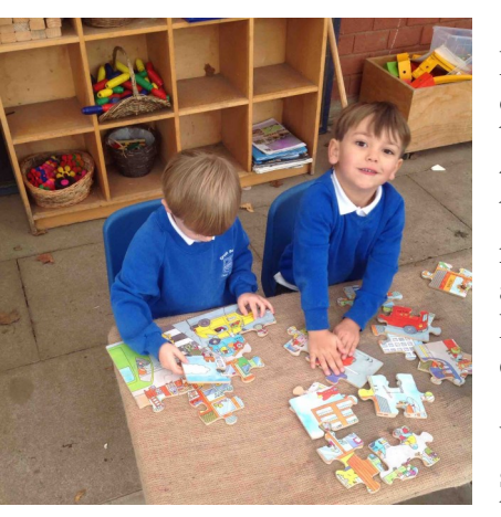
Working together to complete the farmyard puzzle.

During our first half term in school, we have been exploring our inside and outside learning environments. We have been discovering all the different learning opportunities in the environment. We have been building dens, exploring block play and construction and starting our phonic and maths carpet time. We are enjoying learning our sounds and are finding many recognisable graphemes in story books. Furthermore we have started our story scribing in our special books.