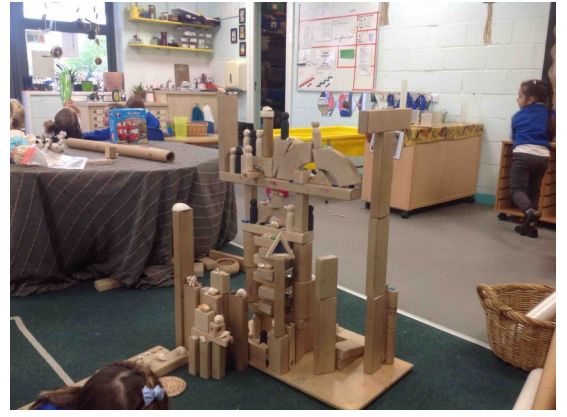
Illustrating our ideas and design in construction