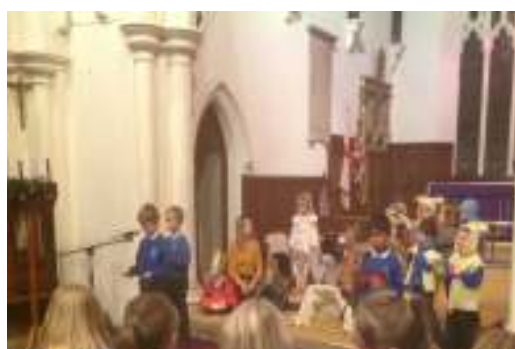
Carol Concert Owls and Puffins