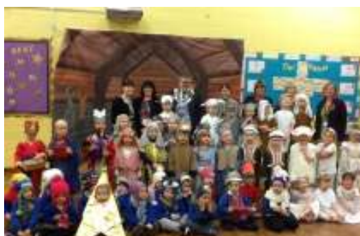
Nativity Play Wrens and Robins