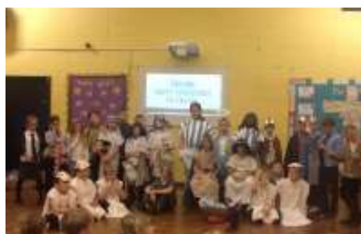
Tinsel and Tea Towels Kingfishers/Woodpeckers and Eagles

Well done to everyone who took part in the school productions they were brilliant and enjoyed by all.