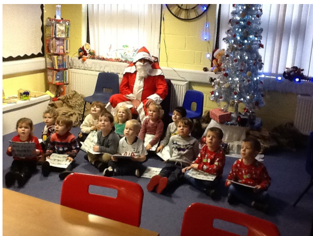
We all enjoyed meeting Father Christmas.