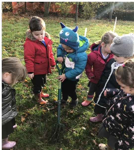
We have planted 14 saplings to create a new woodlands on the school field.