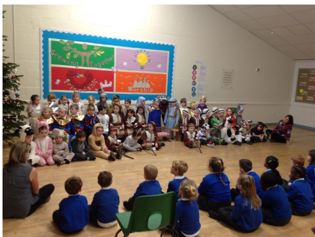
Ducklings and Doves Christmas Nativity