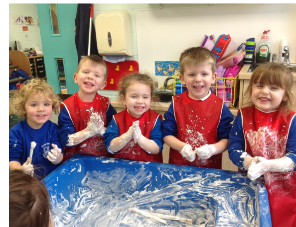
Some children were exploring in the foam tray. They made different shapes and then wrote some of the letters from their names in it. Finally we all had great fun making different noises, whilst clapping, tapping with the foam in our hands. They children thought we looked like we had been in the snow afterwards.