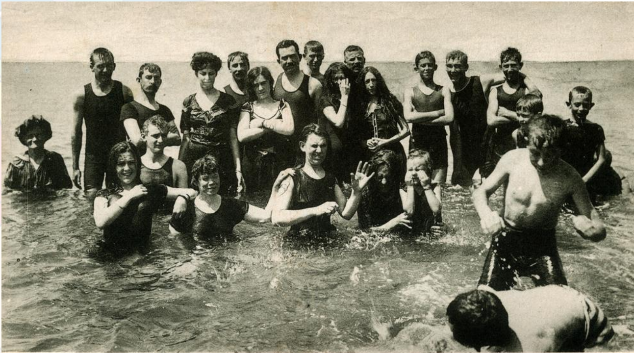
Mixed Bathing, Redcliffe, Qld.

Sunbathing wasn't in fashion back then, so Victorians would go to the beach fully clothed. 'Sea bathing' was done instead.