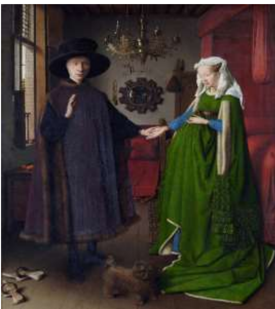
Arnolfini Portrait by Jan van Eyck

Photos to be in by Friday 22 nd June so you have two weeks to create something amazing.